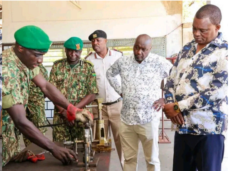
Tour of the NYS Technical Training Institute, Mombasa County