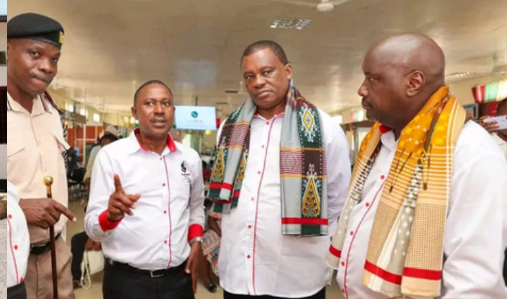
Tour to assess service delivery at the Mombasa & Kilifi Huduma Centres